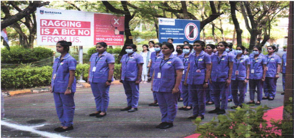
March past students are gathered on the occasion of republic day