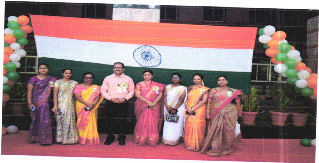
Faculty members are with the distinguished guest.

Principal SREE NARAYANA NURSING COLLEGE Chinthareddypalem, NELLORE-524 002