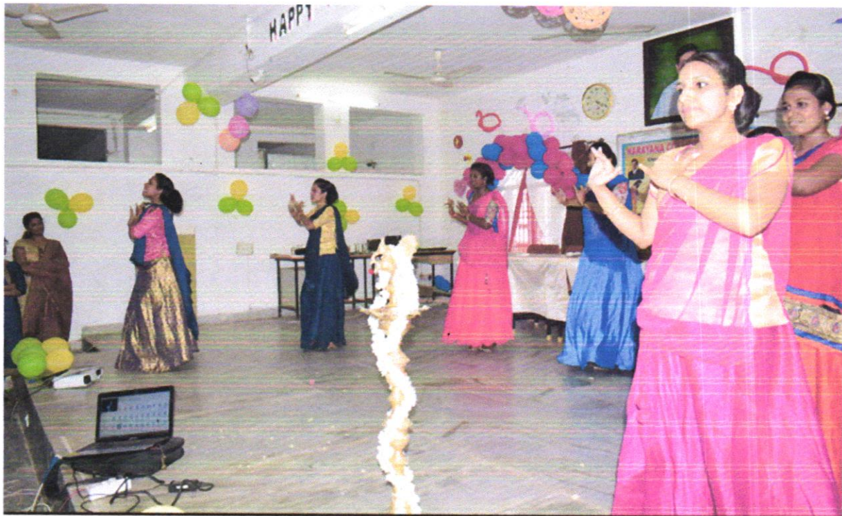
A beautiful welcome dance by 1 st year BSc nursing students

The program was concluded with the vote of thanks by followed by National anthem.