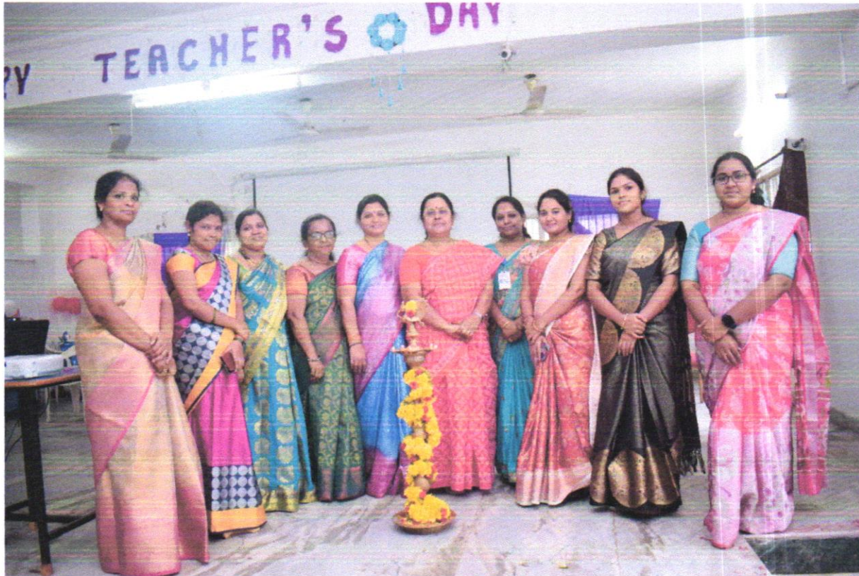
Lamp lighting by the dignitaries