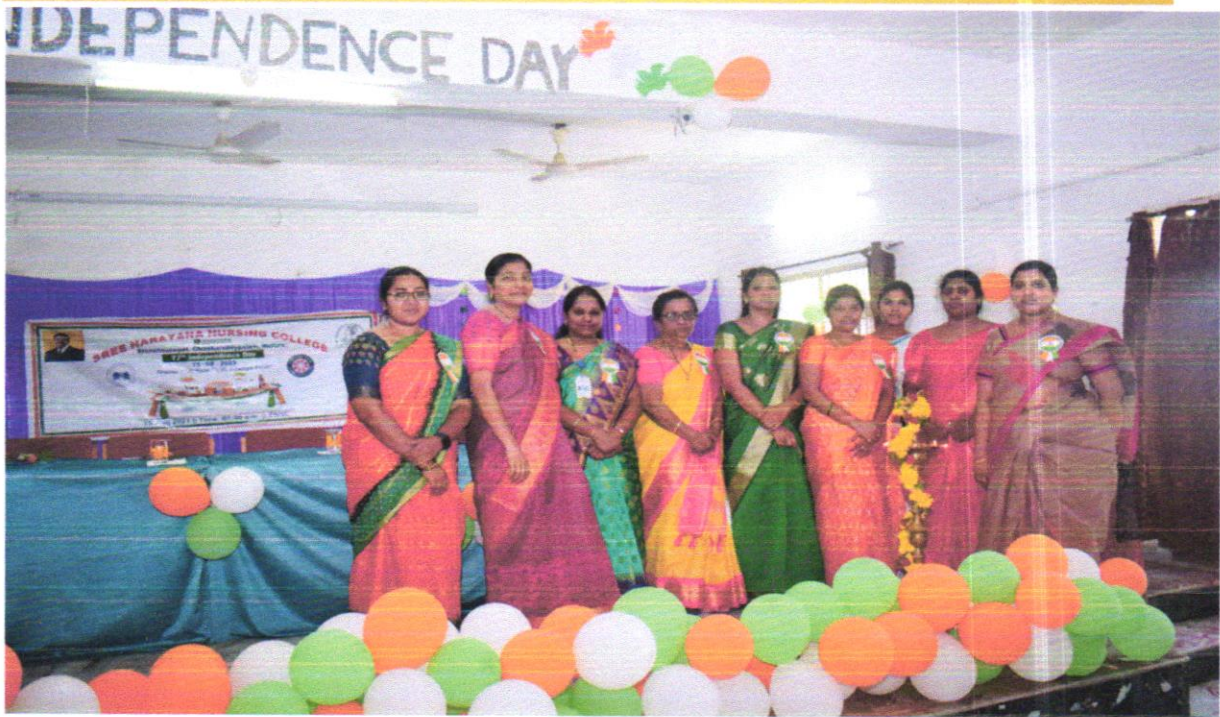
Lamp lighting by the dignitaries