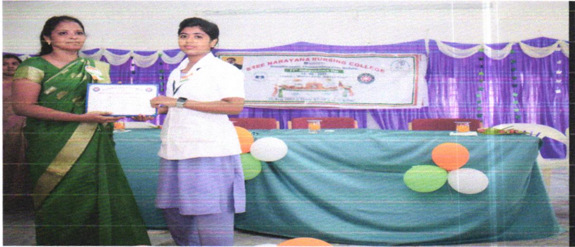
Winners of the Competition