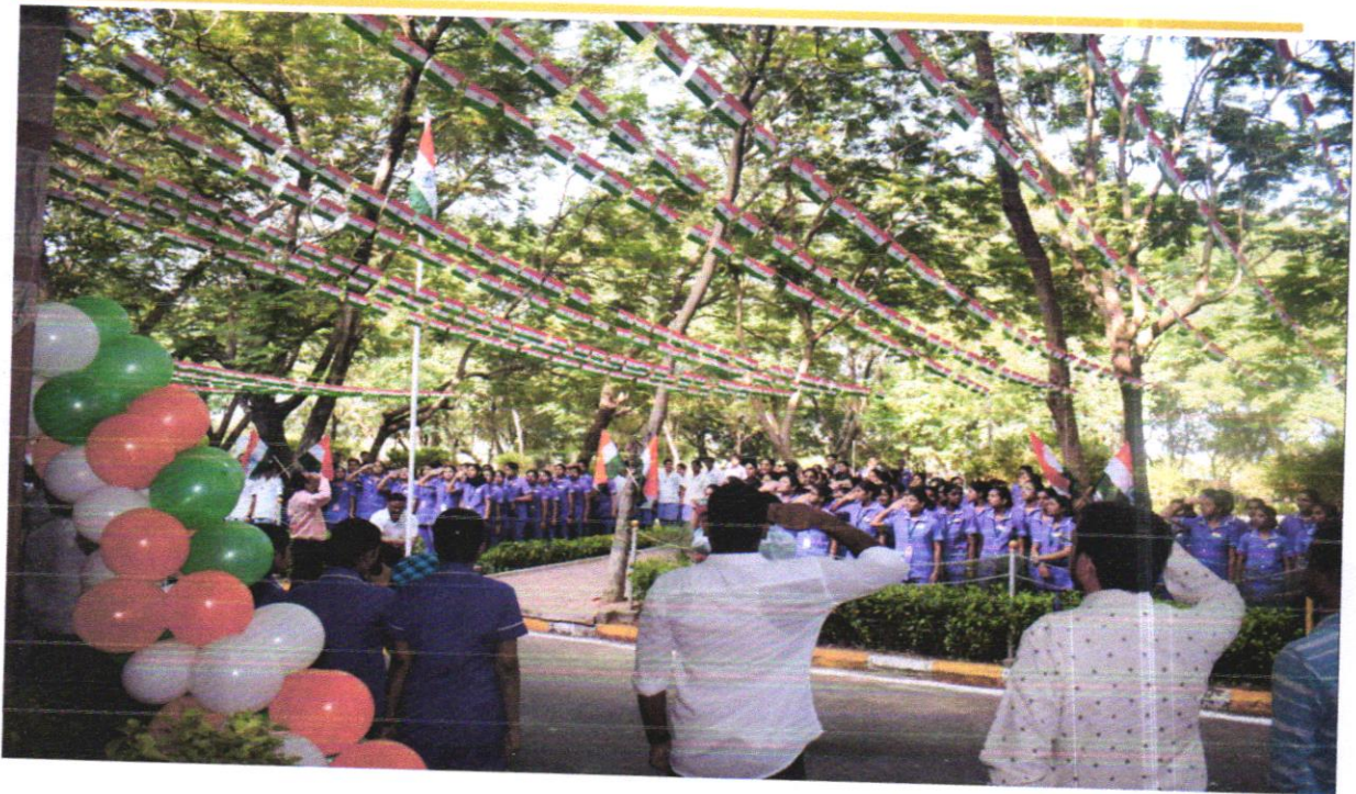
Flag-hosting by the distinguished guest